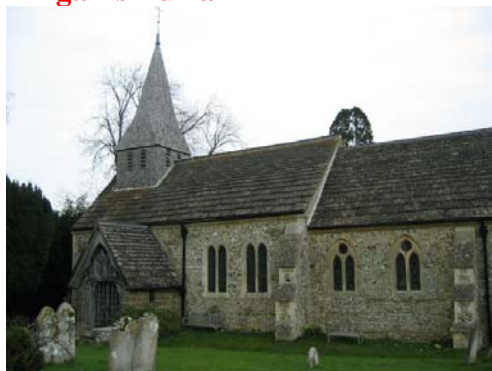
Stephen Milligan is buried at St Peter's Churchyard, Horsham.

Stephen Milligan is survived by his brother who is a clergyman. Stephen Milligan's body is buried on consecrated grounds at St Peter's Churchyard, Woodmancote, Horsham District, Sussex. 19