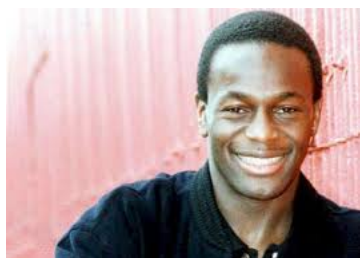
Footballer Justin Fashanu

MP Stephen Milligan had also become aware of Conservative Party internal plans to prevent British footballer Justin Fashanu 24 from making public his claims that he had been involved in homosexual activity with two senior Cabinet Members of the government. In fact footballer Justin Fashanu also died. Fashanu died on 1 May 1996, two years after Stephen Milligan died, apparently from suicide. 25 Being unsuccessful in selling his scandal story to British newspapers, Justin Fashanu emigrated to the United States to become a coach for the Maryland Mania Club and shortly afterwards, a male teenager 26 complained to Maryland Police that Justin Fashanu had committed a sexual assault on the 17 year-old. 27