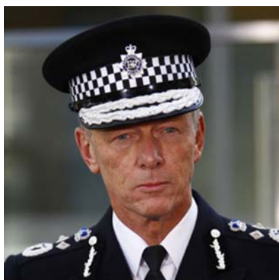
Met Police Hogan-Howe

It is also to be noted that the Press have an unfettered range of real and/or imaginary tip-offs from all and sundry, where any homosexuality is concerned. Protection of sources means that newspapers can write almost any fantasy they wish to, regarding a death they deem to be a deviant sexual death.