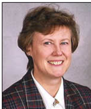
MP Judith Chaplin

Mike Hancock had, like Stephen Milligan, served on the Select Committee on Defence. It is interesting that he mentioned Stephen Milligan's support as MP for Eastleigh when Milligan had only been so appointed a couple of years before his sudden death, as compared to 30 years of support from Mike Colvin.