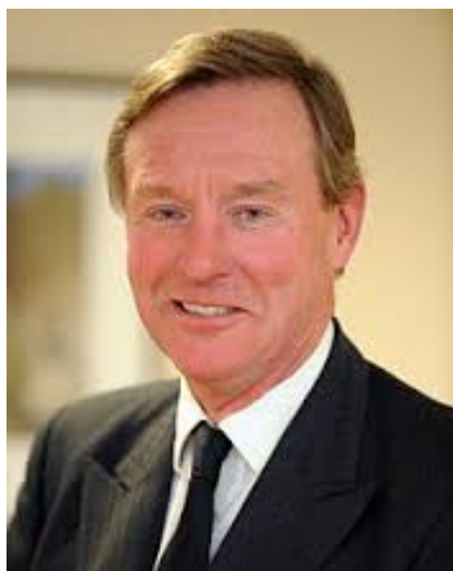
MP Andrew Robathan

7. Mr Andrew Robathan (for Blaby) said in the House of Commons Hansard Debates on 27 January 1997, (Column 62) (on the registering of sex offenders):