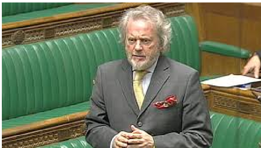
Member of Parliament the Right Honourable Mike Hancock

6. On 28 February 2000, in the House of Commons, at Column 106, Mr Mike Hancock (Portsmouth) said, on the deaths of Michael Colvin and of Stephen Milligan MP: