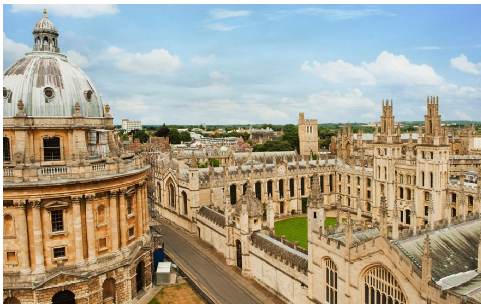
Magdalen College, Oxford University.

Stephen Milligan first worked for the Economist (1972 to 1980) before joining the British Broadcasting Corporation ('BBC') as presenter of Radio Four's 'World Tonight' programme. After three years at the BBC , he moved to the Sunday Times as Foreign News Editor and Washington Correspondent. In 1988 he returned to the United Kingdom ('UK') to work at the BBC as European Correspondent. He resigned from the BBC in 1990 upon being nominated a candidate for the safe Conservative constituency seat of Eastleigh in Hampshire.