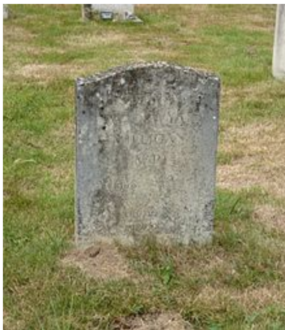
MP Stephen Milligan's grave in Sussex

Stephen Milligan was allegedly informed by the security services that as his efforts at dissuading Justin Fashanu had failed, the footballer would be killed with his death being made to look like an accident.