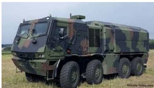
UK military equipment for sale

9. The very tangled and long history of the Saudi-UK Arms Trade must also be considered here. The cold facts are that for decades before the 1994 Milligan death, arms sales by the UK to the Middle East, especially to Saudi Arabia, had been an integral part of the UK arms industry to such an extent that even as long as 50 years ago- as 1966- the UK government appointed a ‘Government Arms Salesperson’, signalling that it had become UK policy to exploit its armaments capabilities for economic gain.