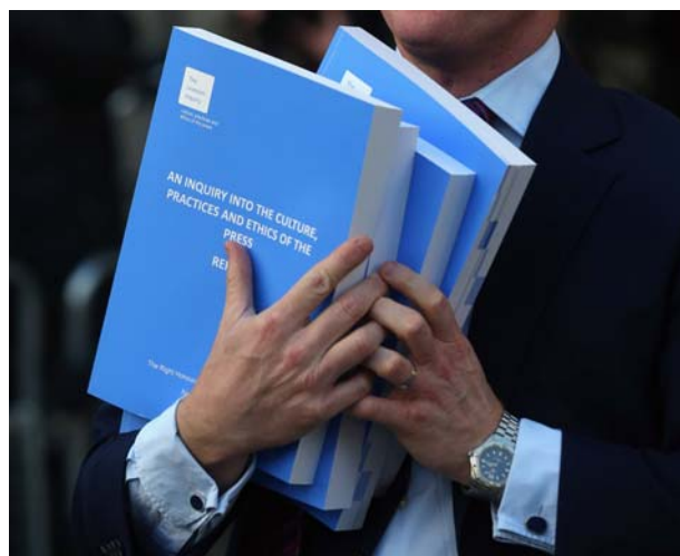
Leveson Inquiry Report 2012

It is also to be noted that the Press have an unfettered range of real and/or imaginary tip-offs from all and sundry, where any homosexuality is concerned. Protection of sources means that newspapers can write almost any fantasy they wish to, regarding a death they deem to be a deviant sexual death.